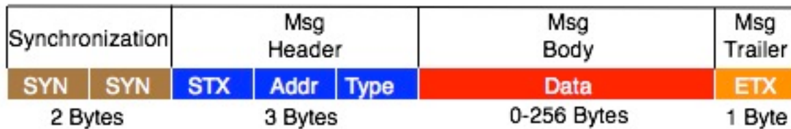
Figure 1 CMRIInet Message Format